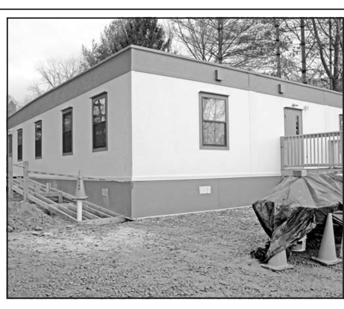
The new headquarters for the North Enotah Drug Court are located across from the Union County Public Library, in a building built just for the program. Construction is still underway, though the building is fully usable and began housing classes two weeks ago.

are located in a specially designed, 2,600-square-foot modular unit across from the Union County Public Library, where they were installed the week of Christmas.